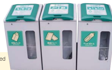
Store collection box installed in the supermarket.