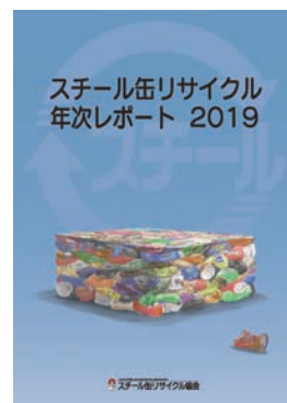
Annual Report on Steel Can Recycling 2019

Promoting efforts toward partnership among the actors for making recycling society