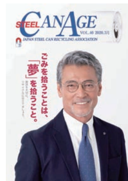
Steel Can Age vol.40