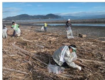
Practiced “Campaigns for Anti-Littering and Beautification” in Yaizu